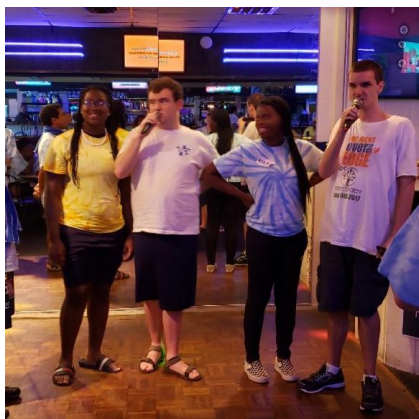
The Kellam grant supports programs like bowling, karaoke, cooking, and more.