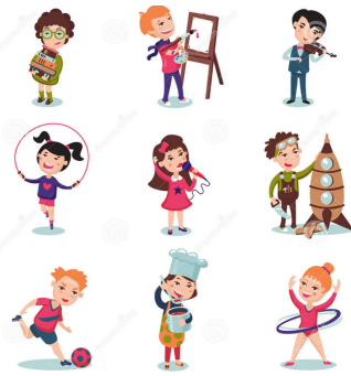
Hobbies and Leisure Programs