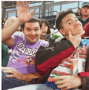
Social Programs for Teens and Adults